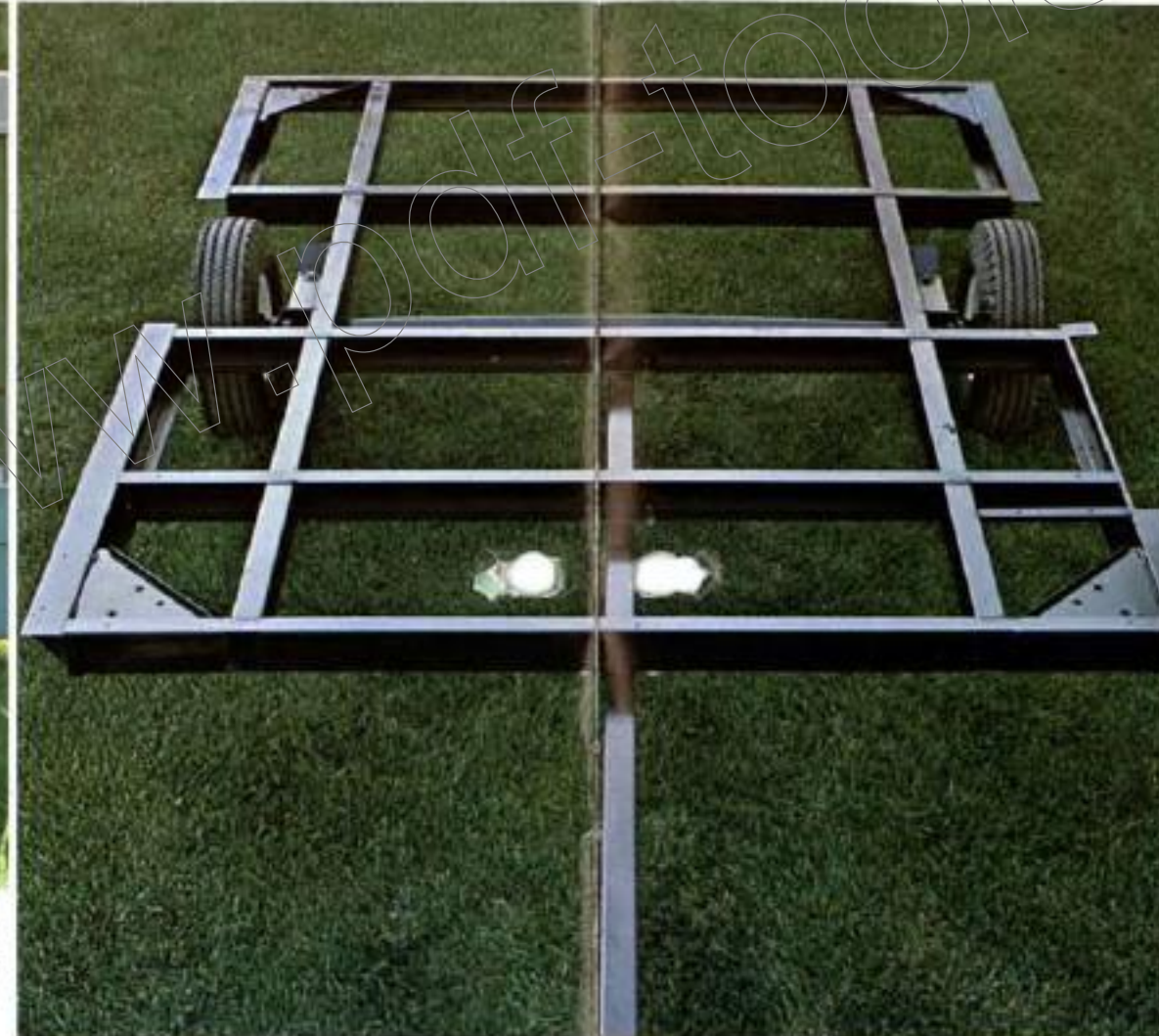
Exclusive interlocked frame. Distributes weight evenly. Heavy steel frame members are not only welded,