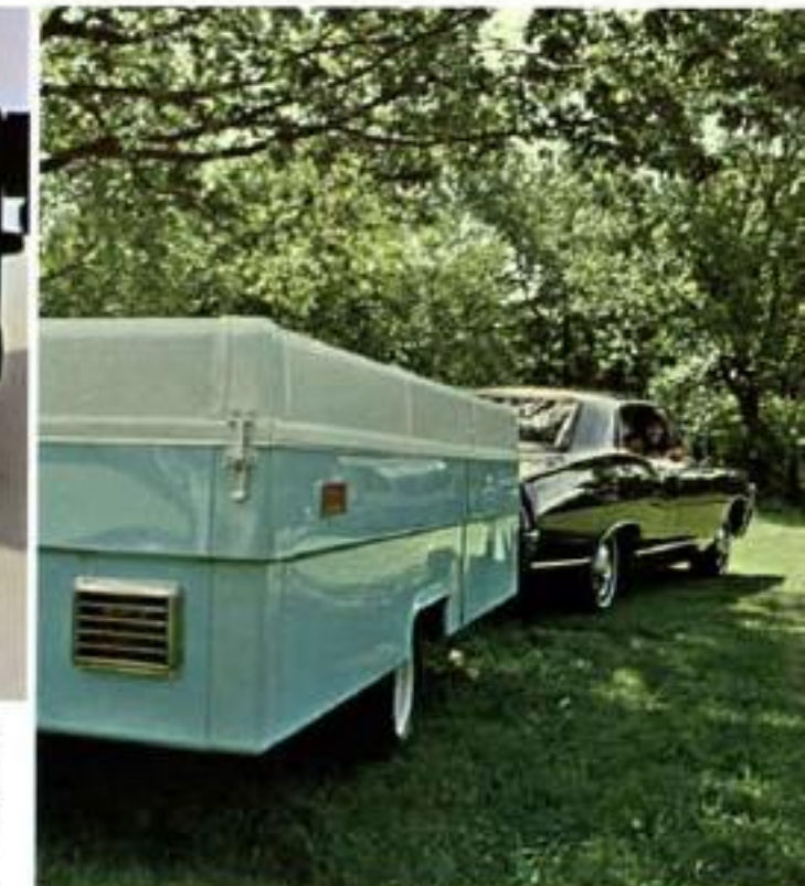
Aluminum body and hard-top. Both body and top are rugged, corrosion-resistant, top-grade aluminum. Finished to last with long-life vinyl coating.