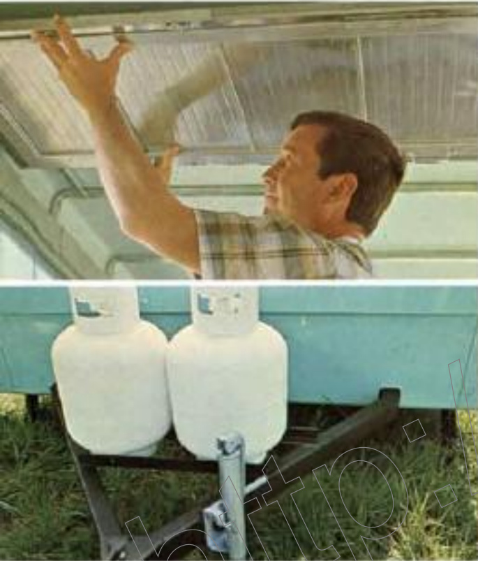
Up she goes. Full-height screen door stores in trailer roof during travel—out of the way.