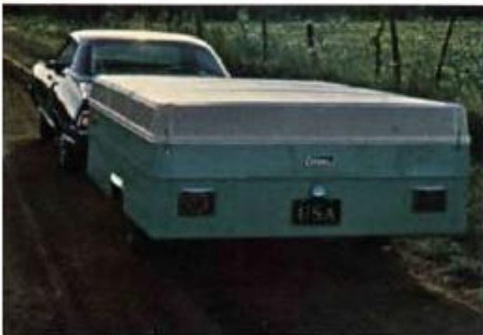
Low-profile styling. Sleek as the modern car you drive. Low silhouette lets you see the road behind you. Safer, better visibility.