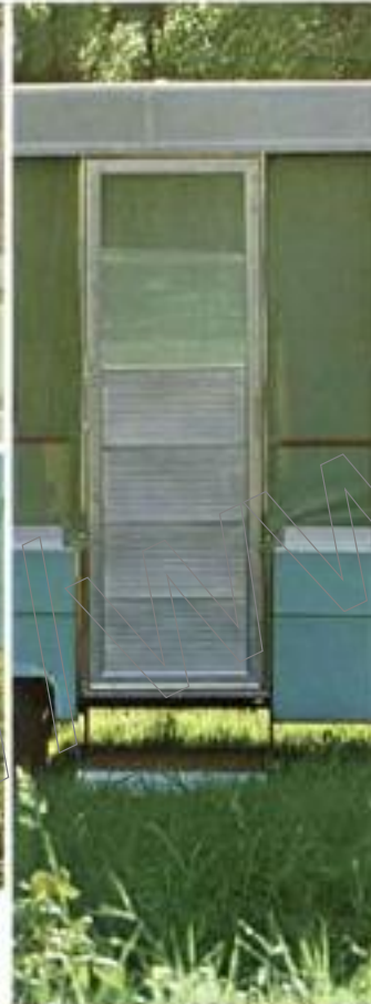
Permanent screen door swings down. Quick set up. Contains self-storing storm window—door is aluminum for long life.