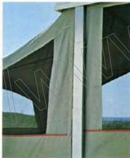
All-new set-up system. Here's Coleman's new telescopic pole set-up system. Solid, smooth and dependable—it simplifies raising.