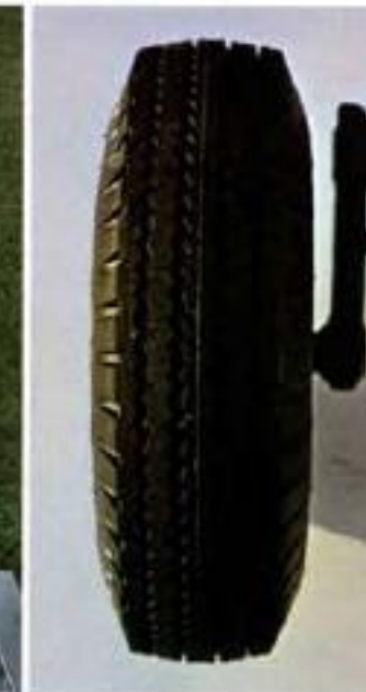
Easy-Riding torsion bar suspension. Coleman agrees with the leading auto engineers. Independent wheel suspension means greater road stability, smoother going over rough terrain.