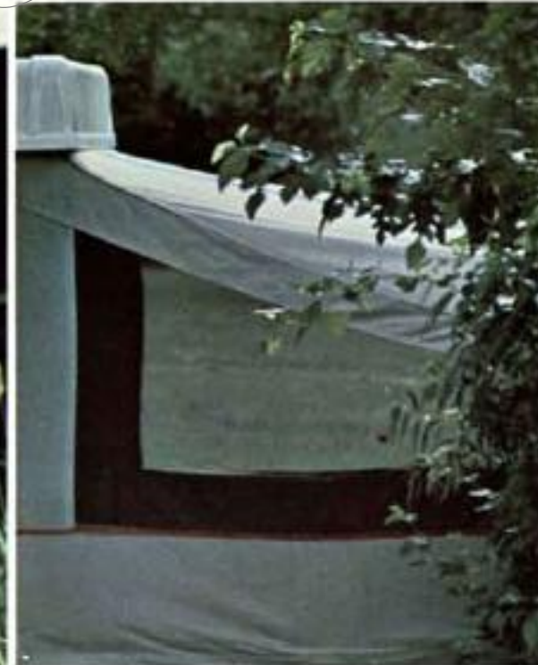
Attached canvas. No fumbling with fasteners. Canvas is permanently attached to the roof, body and bed bows. Quick set-up.