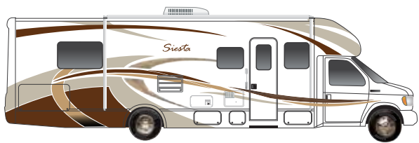
AUTUMN MAPLE PARTIAL PAINT