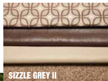
SIZZLE GREY II