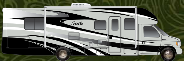
SILVER STORM FULL BODY PAINT