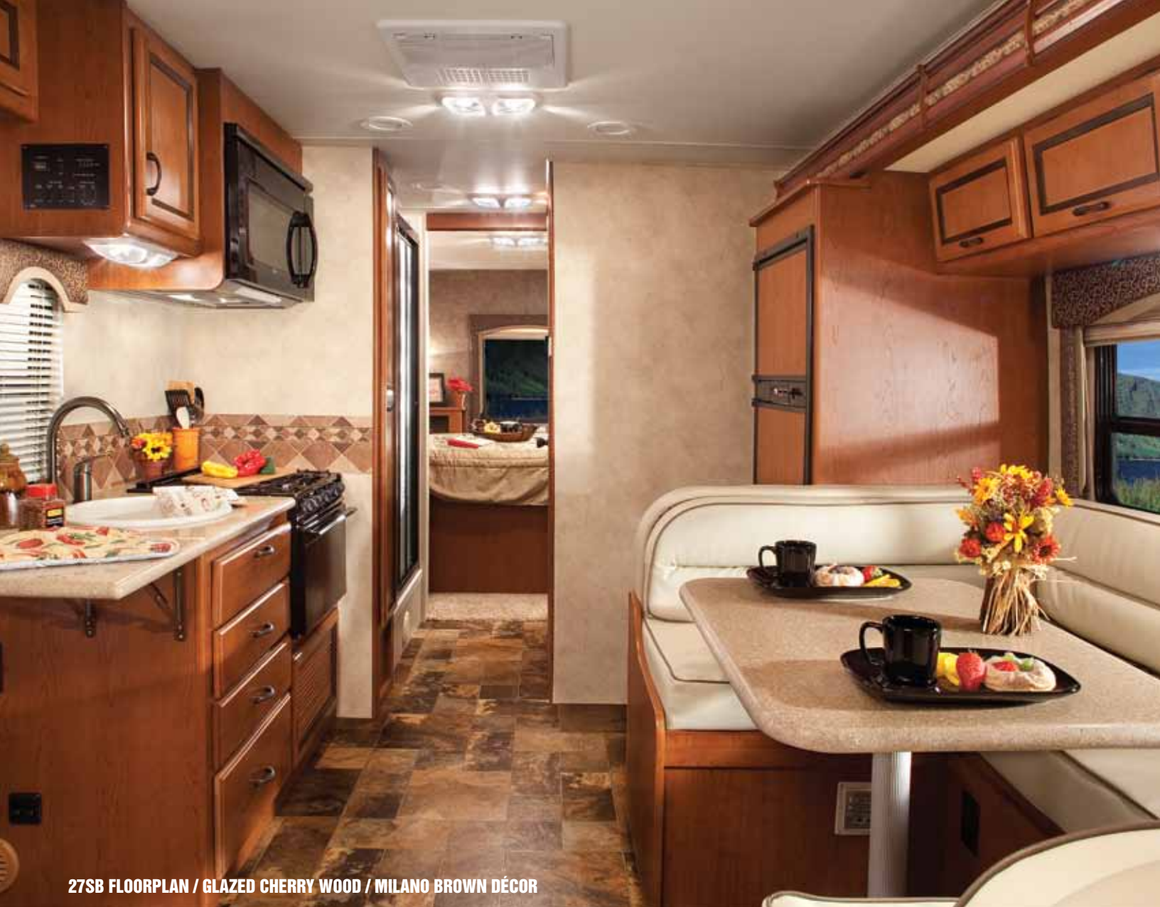
27SB FLOORPLAN / GLAZED CHERRY WOOD / MILANO BROWN DÉCOR