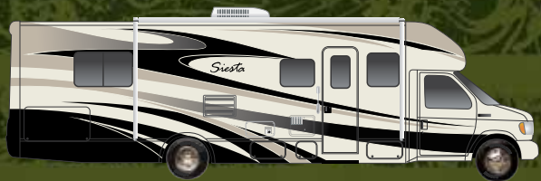
SATIN CREAM FULL BODY PAINT